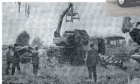
KUKA discarded-vehicle press vehicle