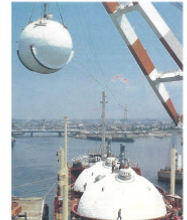
Tanker vessel tank manufacture