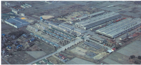
Current headquarters and plant (Moriyama City, Shiga Prefecture)