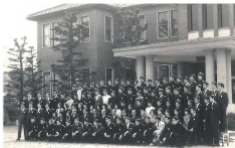
Welcoming ceremony for new employees